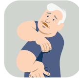
Shoulder/s or Back